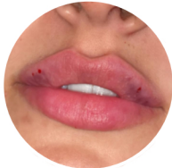
Bruising during treatment: normal

The above 2 pictures are examples of when an artery has been compressed or blocked by filler and it is not able to carry the blood supply around the face. This is called a ' vascular occlusion ' and can become very serious if left untreated.