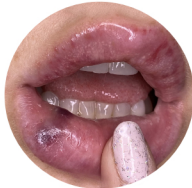
Bruising several hours after treatment: normal